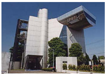
gate of TITech

TITech is located within 1 minutes from Ookayama Station